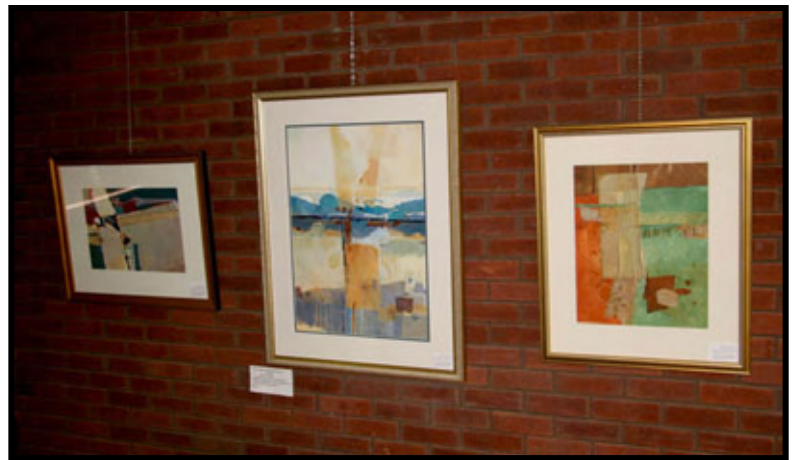
Some of Sue Egbert's art on display